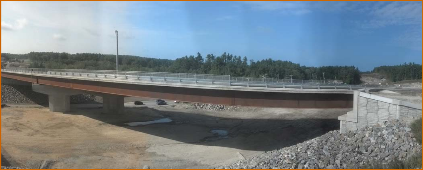
Panorama of Completed SB Bridge over Route 111, 09-13