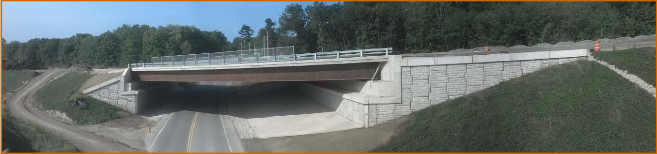
Panorama of Completed SB Bridge over Route 111A, 09-13