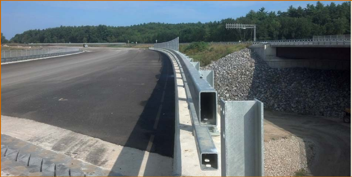
Route 111 Bridge Rail 09-13