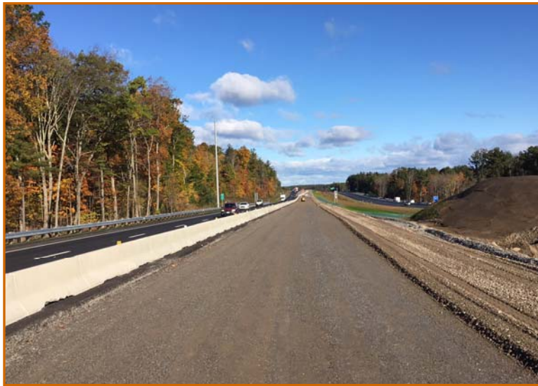
SB BARREL FINE GRADED AND READY FOR PAVEMENT, NORTH OF STONEHENGE ROAD