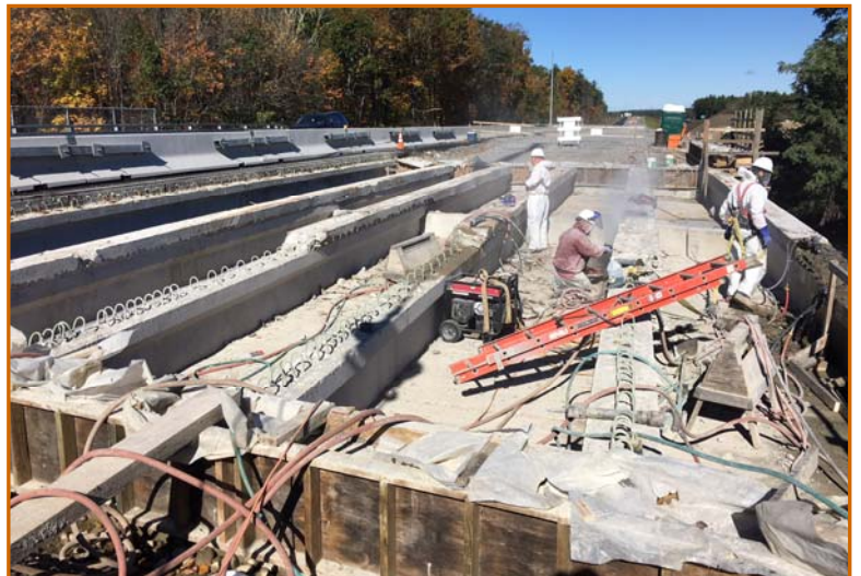
CHIPPING BEAMS ON SB BRIDGE OVER STONEHENGE ROAD