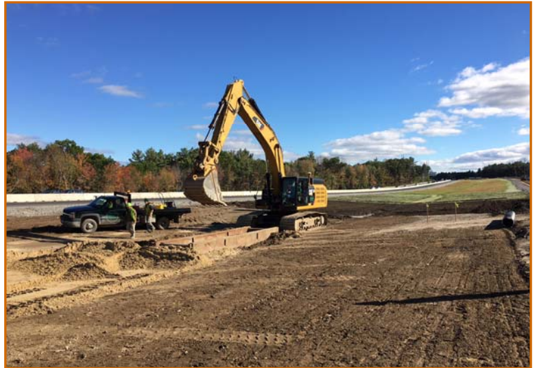
MEDIAN DITCH LINE DRAINAGE INSTALLATION