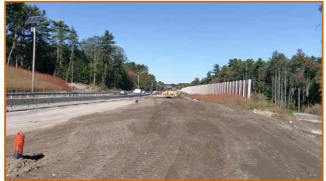
GRADING THE ROADBED AT THE NB SOUNDWALL