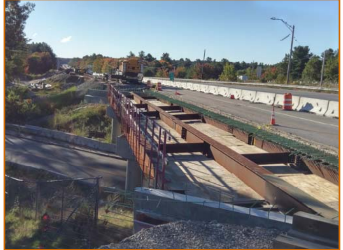
BODWELL AND COHAS BRIDGES