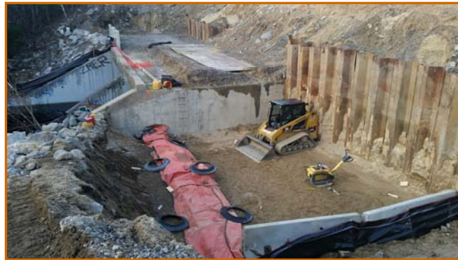
SB MSE WALL CONSTRUCTION