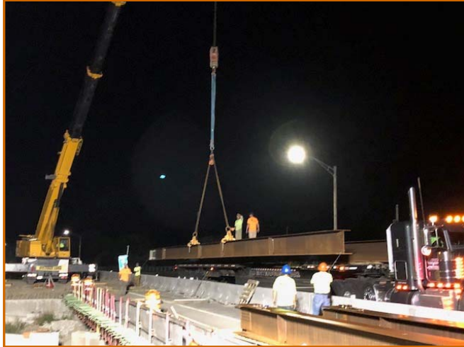
SETTING STEEL GIRDER AT BODWELL BRIDGE