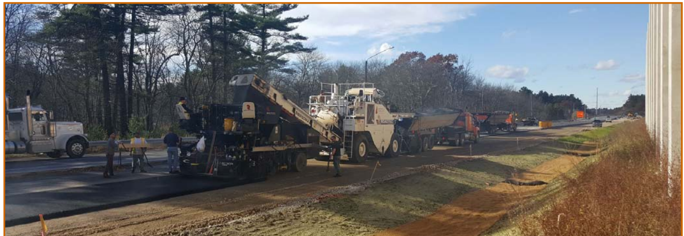
NB PAVING NEXT TO SOUNDWALL