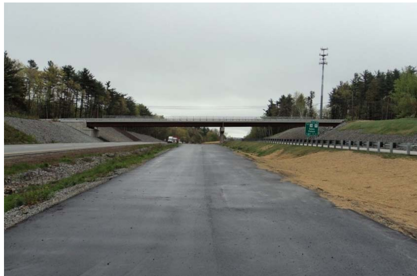
LOOKING SOUTH AT NEW BROOKDALE ROAD BRIDGE, 05-03-2012