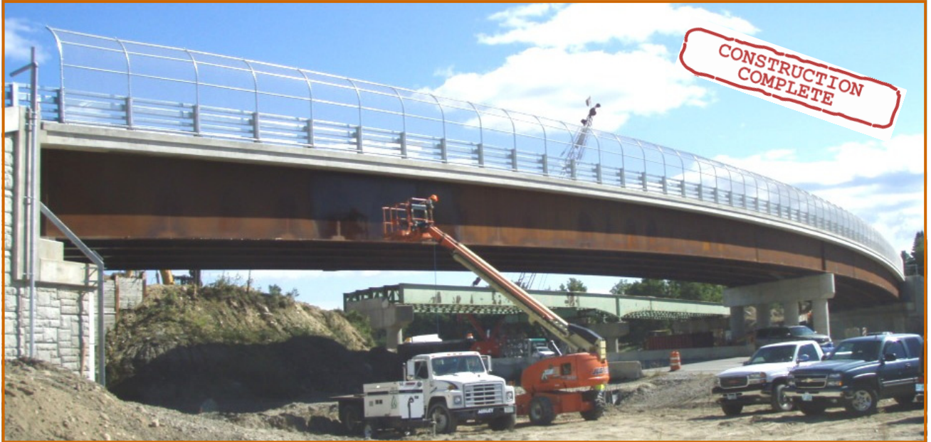
New Cross Street Bridge opened to traffic August 21, 2008.