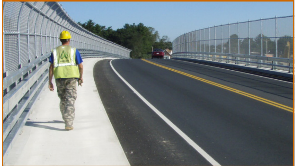
New Cross Street Bridge