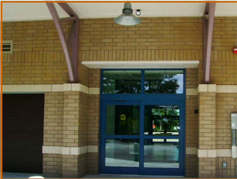
Bus Terminal—Opened May, 2007

Goguen Construction Company has completed construction of the new bus terminal at the Exit 4 Park-and-Ride (PNR) . Construction of the terminal began in January of 2006 and the terminal was opened to the public on May 14, 2007. There were minor improvements to the existing parking lot while the new facility provides improved access to bus services.